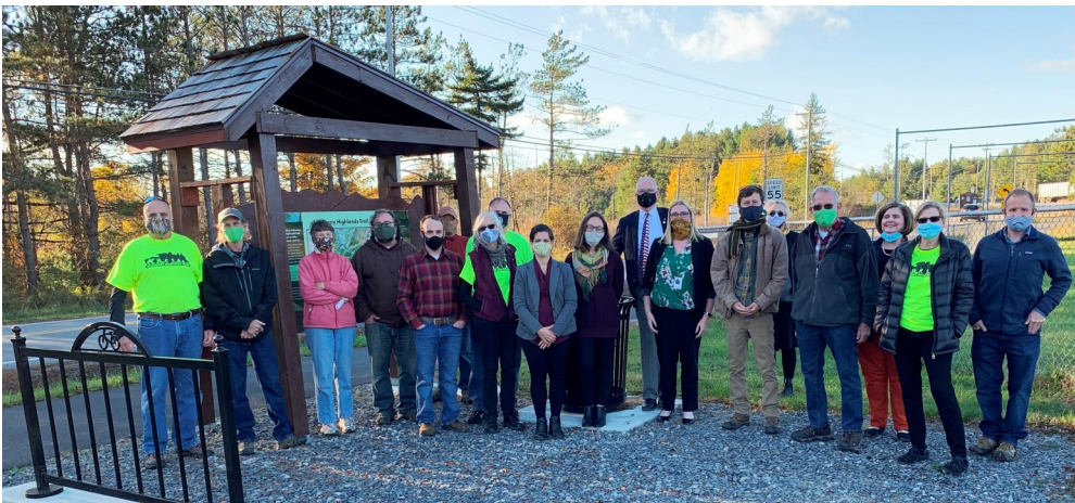
Project partners for the Davis Trailhead Kiosk include Heart of the Highlands, Tucker Community Foundation, Western Pocahontas Properties, and Town of Davis

A dedication marking completion of the Davis Trailhead was held Oct. 13 at the Davis Ball Field / Tucker Boulder Park site. HTF hosted the event in partnership with Heart of the Highlands and the Town of Davis Parks & Recreation Commission. The trail connector will tie into the Allegheny Highlands Trail project once the Davis exit of Corridor H is complete.